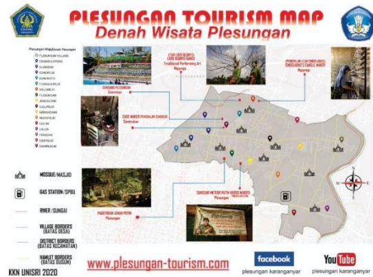
Figure 1. Plesungan Tourism Map (a Result of Training Making the Map)

Map. In designing X-banner and MMT, the students' trainers used canva, kinemaster, and corel draw. Besides, in designing tourism map (by Mr. TJB), he used website of Plesungan village.