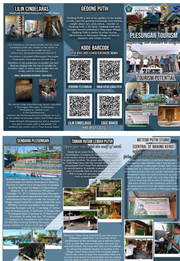
Figure 3. English Brochure about Plesungan (a Result of Training Making a Brochure)

conveyed the result of their work and expressed their difficulty in doing the assignment. All participant showed their works well and conveyed their difficulty properly. They stated that their problems were usually about how to make the content for the brochure in English and how to design it attractively. The trainers said that they could use their routine activities in actively interacting in the tourism object in Plesungan village as the content of their writing and translate it in English. In design, they could download on google about an example of brochure design and practice to imitate.