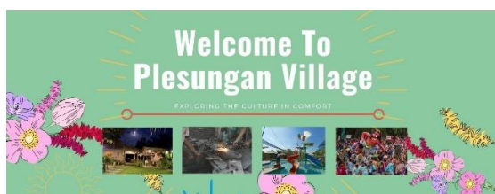
Figure 2. Electronic X-banner and MMT about Plesungan Village as a Result of the Training

Next, the trainers asked the participants to use a computer on his desk and practiced to use canva and kinemaster in designing X-banner and MMT. They began by downloading software of canva and kinemaster, signed in, and followed the instruction of the trainers in making the design. They sometimes asked a question about how to